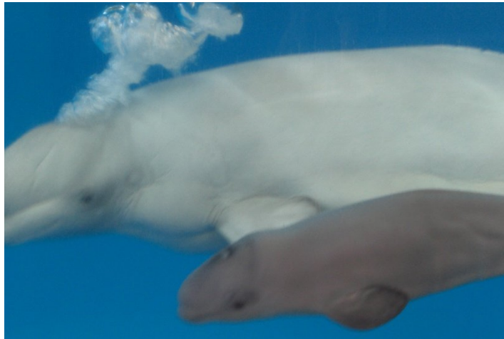
Figure 1. The beginning of a bubble burst by a mother while swimming with her calf.