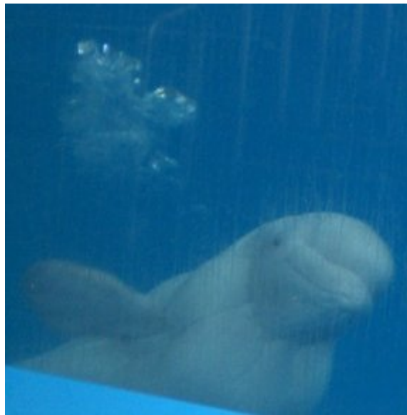
Figure 2. The visual display of a completed bubble burst by a female during a solitary activity.