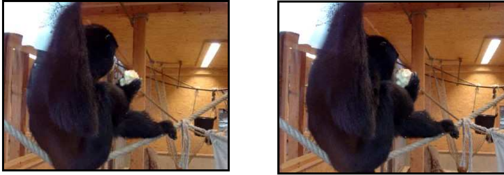
Figure 1. Male siamang ( Hylobates syndactylus ) eating an apple with his right foot.