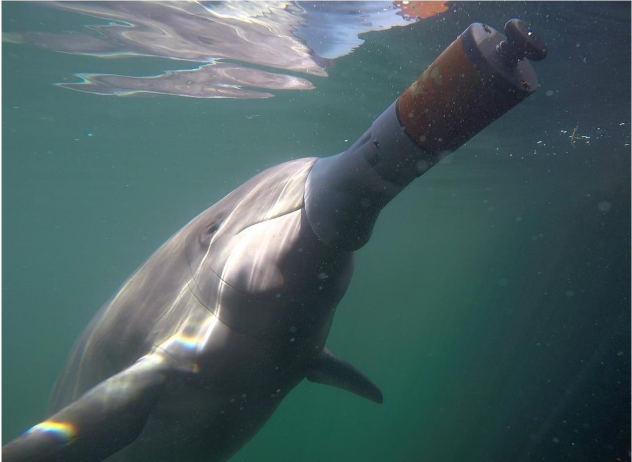
Figure 2. View from a camera near the far-field hydrophone during swimmer marking trials. A dolphin temporarily places its rostrum inside a swimmer marking device, a cone (nose cup) attached to a buoyant marker, used to identify the location of a swimmer.

was then presented with a swimmer marking device comprised of two parts that disassembled when SPL made contact with the swimmer. The first part was a cone that the dolphin was trained to insert its rostrum into. The second part was attached to the cone and upon contact with the swimmer separated from the cone and floated to the surface, allowing the location of the swimmer to be identified (Figure 2). Once SPL was given the marker, she relocated the swimmer and began her approach. Upon marker deployment, SPL returned to the boat, completing the chain of behaviors and received reinforcement.