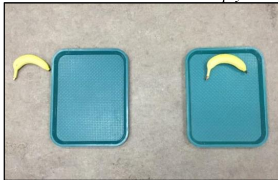
Condition B: On-Off