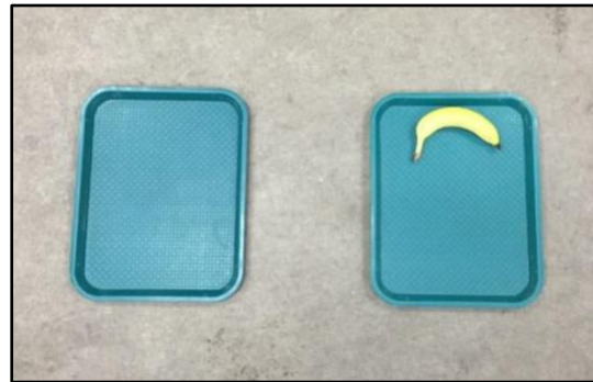
Condition A: Baited vs. Empty