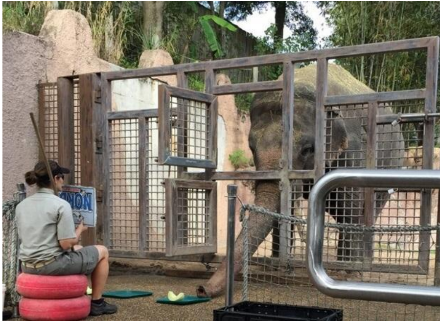
Figure 1. The elephant interaction area (EIA).

Pre-trials. Before starting the research sessions, the trunk-reach distance was measured for each subject. For this measurement, a piece of produce was placed on the ground in front of the EIA window area. Chalk was used to mark the farthest point the subject could reach with its trunk extended. Immediately following the trunk measurement, a single, baited tray was placed on the ground at the measured distance. Each subject was provided 2-3 single tray trials to expose the individual to the tray (which the subjects had never seen before). The elephants were encouraged to grab the tray and slide it closer to reach the produce. All subjects learned to do this sliding motion within 2-3 probe trials. One subject (CA) required several additional training repetitions to learn to leave the tray on the ground after sliding it closer. This helped discourage CA from excessively playing with and breaking the trays once trials began.