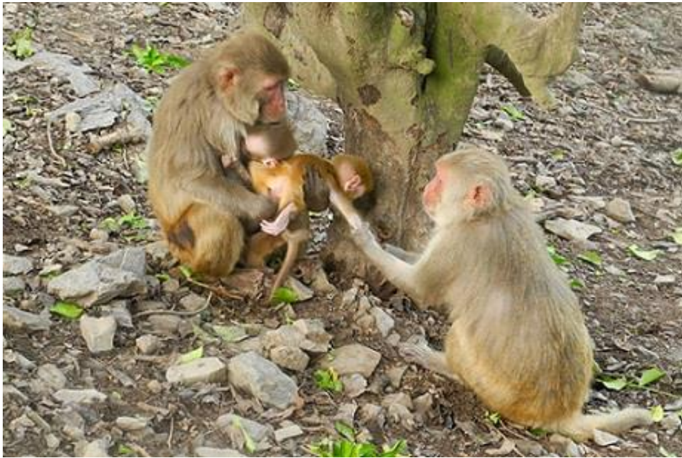
Figure 2. A female rhesus macaque attempts to retrieve her infant from a higher-ranking handler.