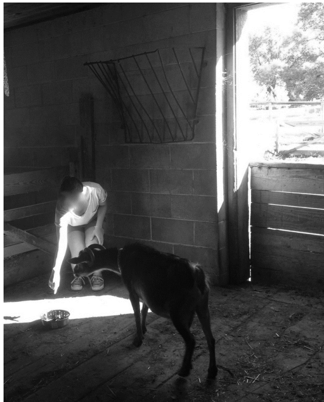
Testing Environment Used for One of the Goats

Note. The image shows the indicator, following a correct choice by the goat, encouraging the goat to eat the food by the bowl.