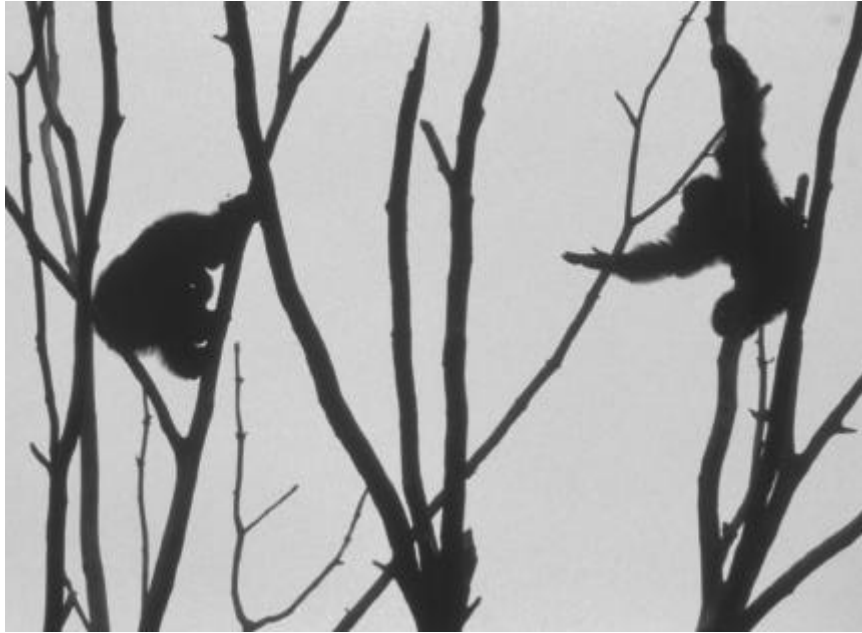
Figure 1. Chimpanzees invite reconciliation by means of eye-contact and hand gestures. This photograph shows the situation ten minutes after a protracted, noisy conflict between two adult males at the Arnhem Zoo. The challenged male (left) fled into the tree. He is now being approached by his opponent, who stretches out a hand. Within seconds, the two males have a physical reunion and climb down together to groom each other on the ground.