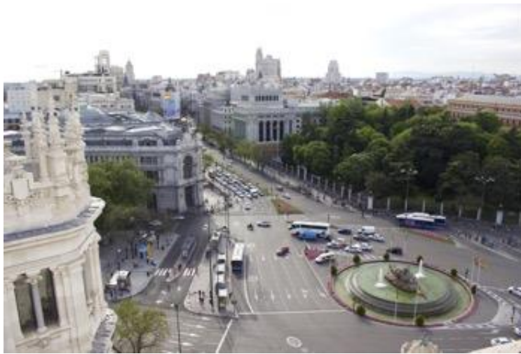
Figure 7 View from the rooftop of the Palacio de Cibeles.