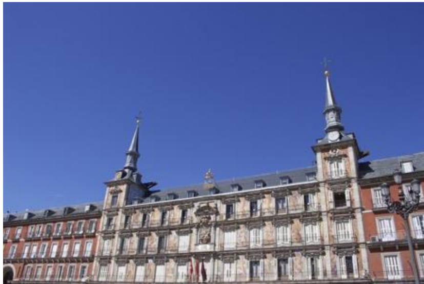
Figure 4 A main section of Plaza Mayor, this area was especially painted and designed to stand out amongst the other walls because this section is reserved for the royal family. This style is also symmetrical in design and reminiscent of El Escorial.