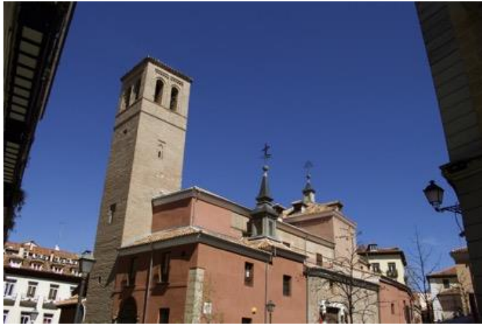
Figure 1 Iglesia San Pedro el Real, this was a more organic take on architecture. This building lacks symmetry, there is only one tower as opposed to two, and notice the windows are sporadically placed around the walls.