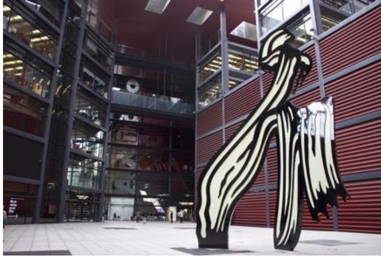
Figure 9 Museo Reina Sofia alternative entrance; note the new and eclectic red paneling on the walls.