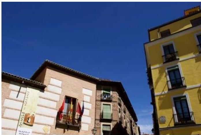
Figure 3 Part of the Torre de Lujanes building, notice the majority of the edifice is primarily red brick. The layering of brick was an inexpensive and practical way to build these edifices during this time.