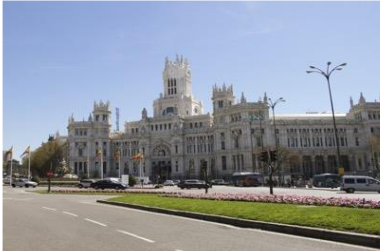
Figure 6 Palacio de Cibeles, the former palace of communications.