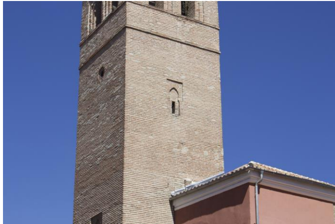
Figure 2 A close-up on the bell tower of San Pedro Church, notice the horseshoe-shaped window.