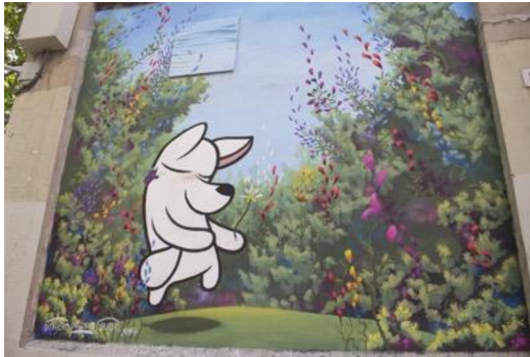
Figure 10 Mural by urban artist in Madrid b the name of Dingo.