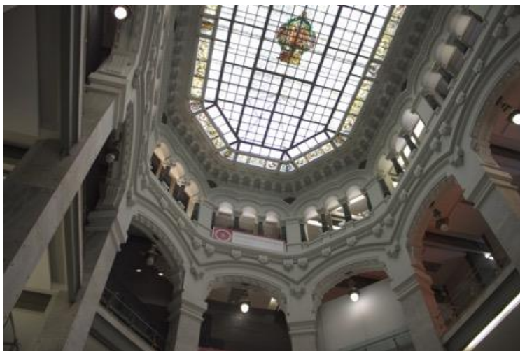
Figure 8 Inside ceiling view from Palacio de Cibeles. Notice the combination of styles of architecture, including the stained glass window at top, the arches, and elaborate borders.