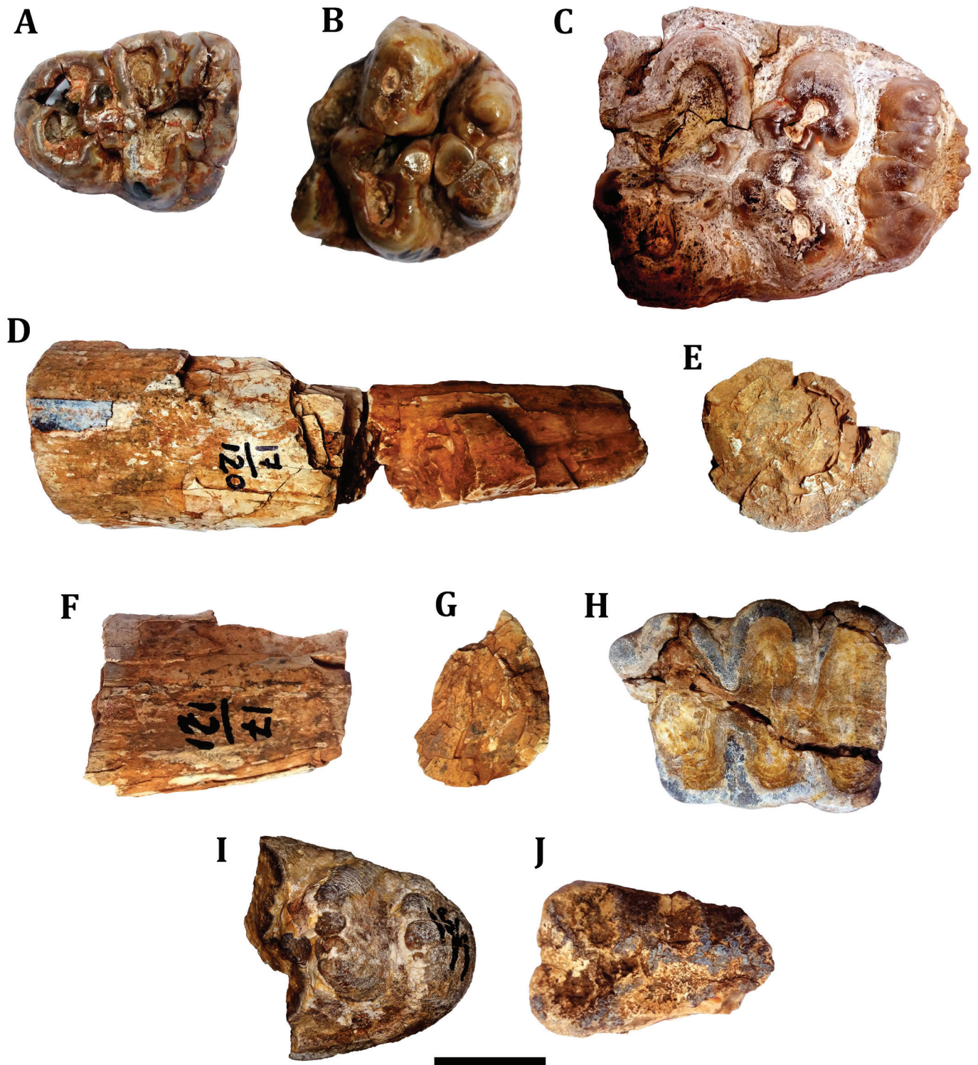
Figure 3. Siwalik proboscidean remains. A–C. cf. Paratetralophodon hasnotensis . A. Left lower fourth premolar (lp4?), PUPC 14/12, in occlusal view. B. Left lower first molar (lm?1), PUPC 15/219, in occlusal view. C. Right upper third molar (rM3), PUPC 15/249, in occlusal view. D–I. Gomphotheres gen. et sp. indet. D. Fragment of the left tusk, PUPC 17/120, in lateral ( D ) and cross-sectional ( E ) views. F. Tip fragment of a tusk, PUPC 17/121, in lateral view ( F ) and cross-sectional ( G ) views. H. Left upper first molar (lM1), PUPC 15/232, in occlusal view. I. Distal fragment of ?left molar, PUPC 15/07, in occlusal view. J. Choerolophodon sp. Deciduous left? lower fourth premolar (?ldp4), PUPC 15/232, in occlusal view. Scale bar=3 cm.