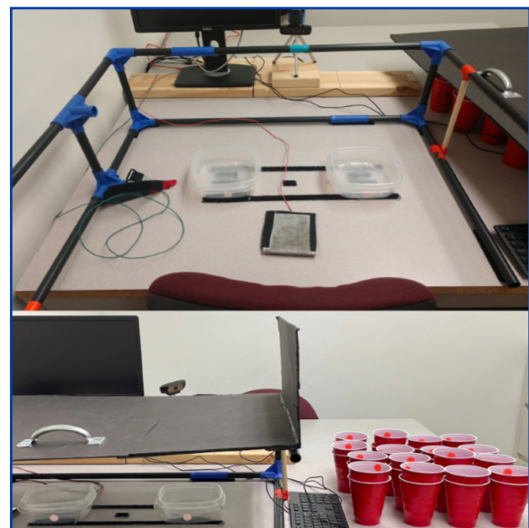
Figure 2: Experimental Apparatus

Note. The target items are indicated in red while the distractor items are blue. The left panel image shows an example of a condition varying by length, while the diameter is kept constant. The right panel image displays the 16 different conditions administered in the experiment.