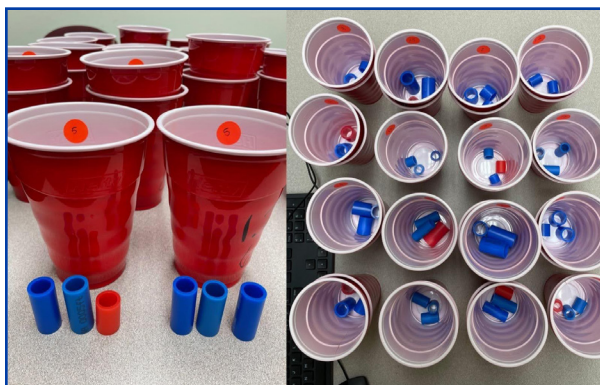
Figure 1: Search Conditions

of one's choosing. Participants wore a velcro anklet which connected the Makey-Makey® device and to the metal touchpad (see Figure 2, top panel) which allowed them to interface with the MATLAB (version R.2023b) data collection program (available upon request). The program indicated whether the touchpad registered any contact during the experiment and provided guidance, such as "Participant, reach for target and touch contact when done," via a monitor facing the participant. The guidance was given as the participant advanced through the program.