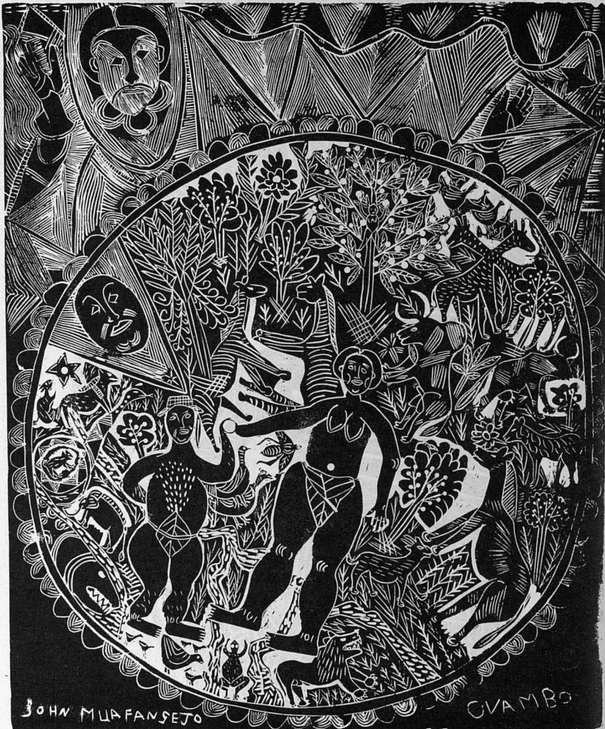
Adam and Eve (1968)