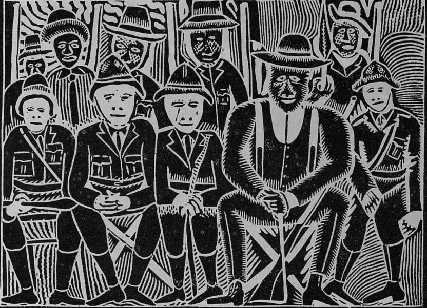
THIS IS THE KUANYAMA KING.