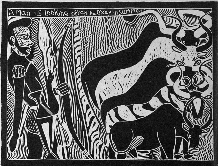
A Shephard (1972)