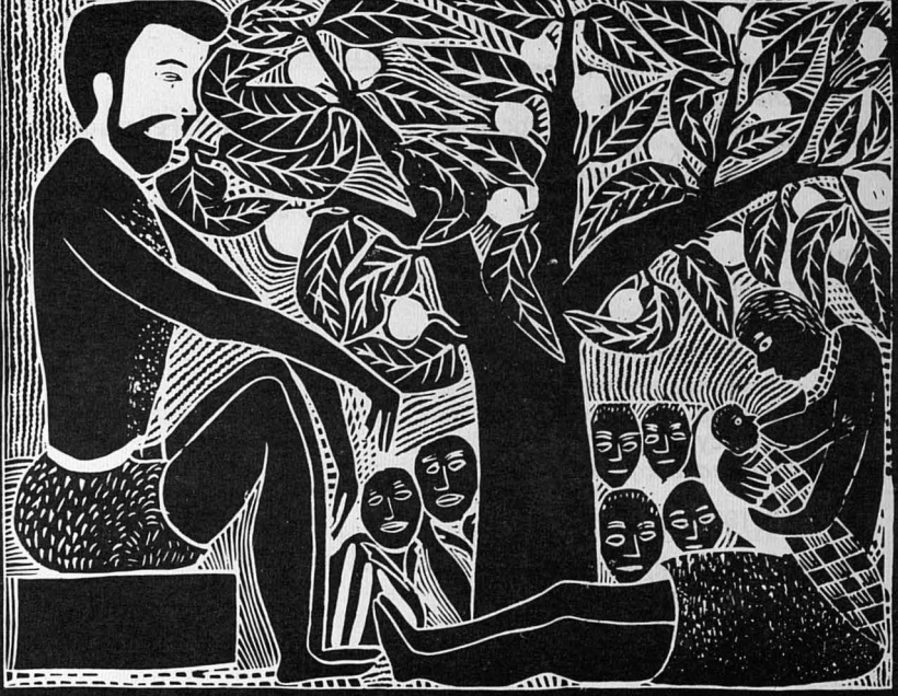
The Sad People (1970)

THEY ARE VERY HAPPY ACCORDING TO HAVE A NEW BABY IN STEAD