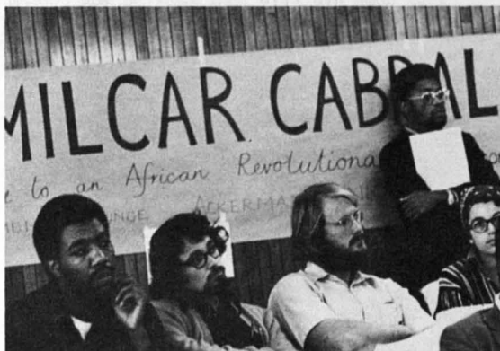
Cabral Memorial Rally at UCLA.