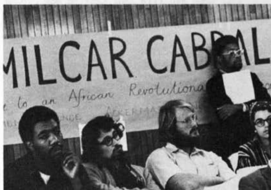
Cabral Memorial Rally at UCLA.