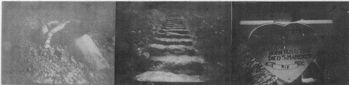
"The graves have been dug in preparation for the next month's toll"