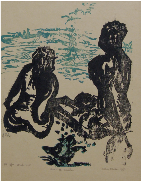
Bar Beach, Lagos , 1972, woodcut, 20 × 15 inches