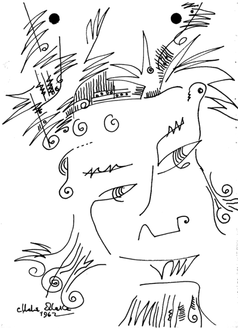
Oja suite, Head of Egbenudba , ink, 7.5 × 5.5 inches