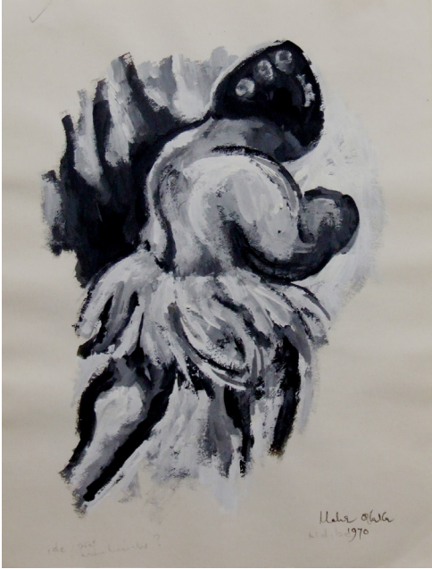
Sketches for Tales of Life and Death IV , 1970, 9.5 × 7 inches