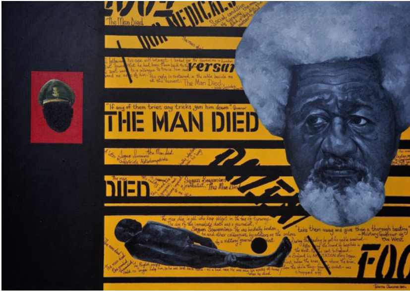
The Man Died , 2015, acrylic, oil and marker on canvas, 122 x 169.5 cm