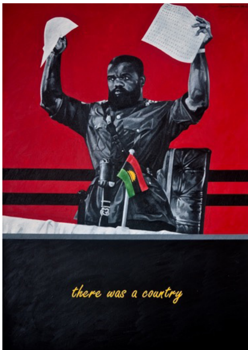
There Was a Country , 2015-16, oil and acrylic on canvas, 169.5 × 122 cm