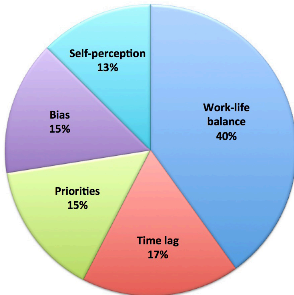
Figure. Barriers to Women in Leadership.

Conclusions: Our study emphasizes the need for institutionally-based programs to promote women leaders in medicine, to support those already in leadership positions and to foster the development of future female leaders. By instating a program dedicated to women in medicine, institutions are promoting gender diversity, which has been positively linked to financial performance. These programs should focus on re-entry for those who take leave, mentorship, and addressing specific barriers women may face. These are key components to promote the success and progression of women in medical leadership positions and to improve institutional level leadership as a whole.