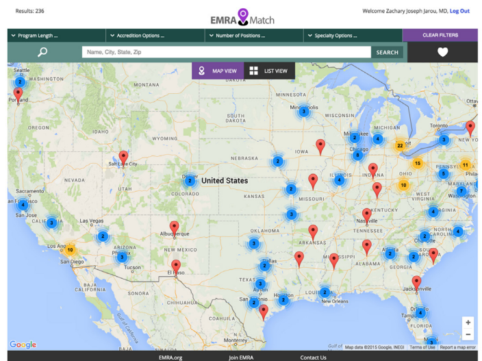
Figure 1. Example "map-view" interface of EM residency programs.

Impact/Effectiveness: EMRA Match v4.0 is an interactive, collaborative, filterable residency catalogue designed to enable students to more easily find the residency program that fits their specific needs.