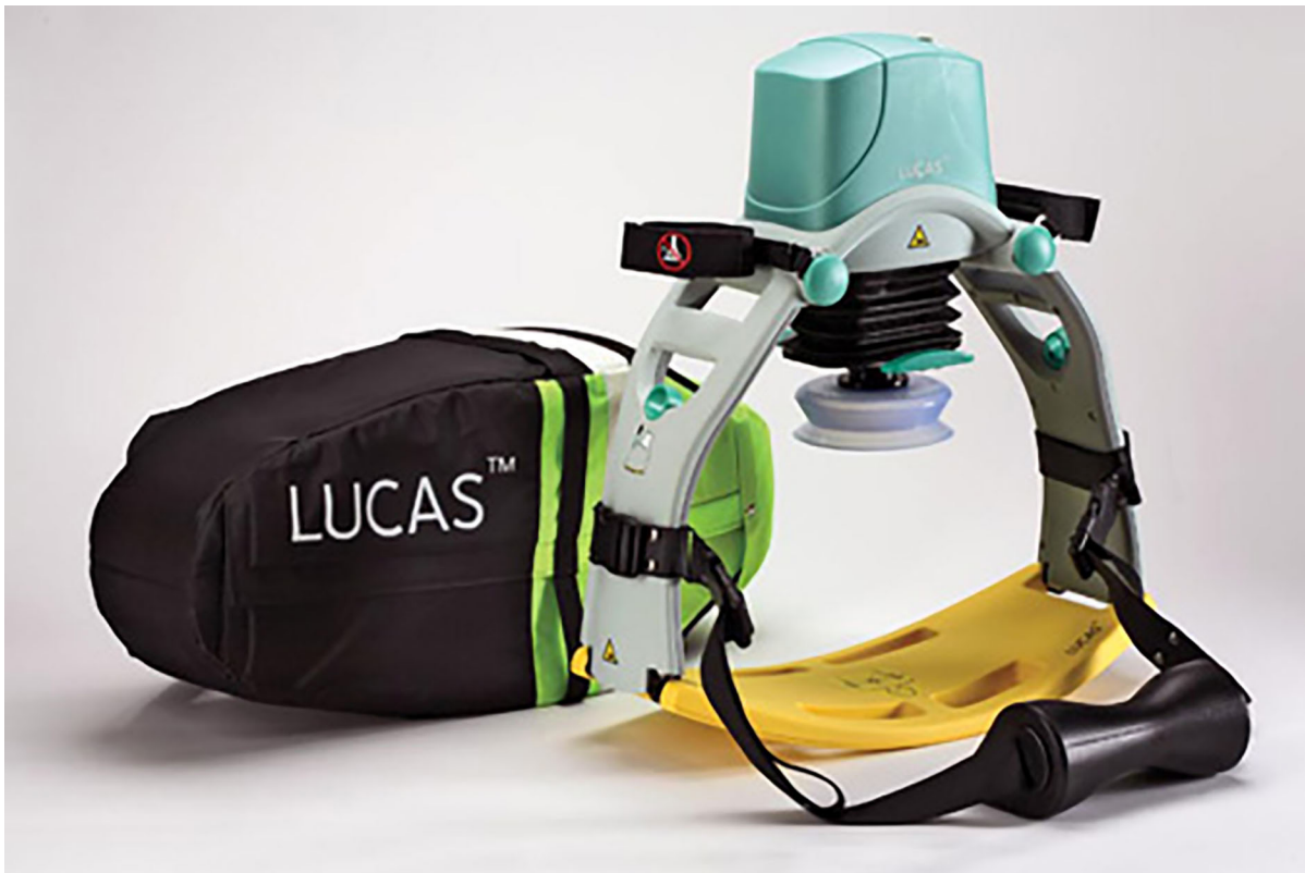
Figure 1. The LUCAS™ chest compression system, a device for mechanical chest compression-decompression. LUCAS, Lund University Cardiac Arrest System.

with the LUCAS device, in which its proper use was demonstrated and the subjects were then permitted to practice and ask any questions about using it.