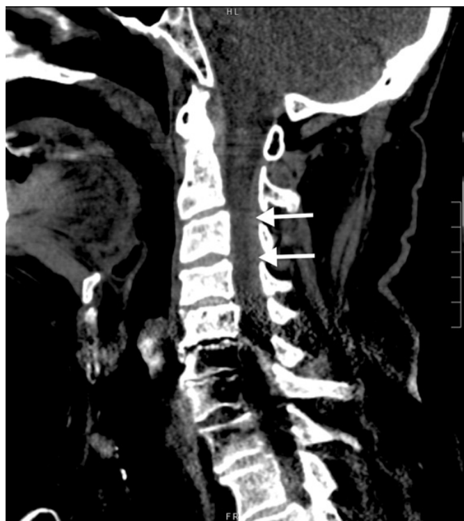
Image 1. Sagittal non-contrast computed tomography of the cervical spine showing hyperdense dorsal epidural thickening (arrows) from second through seventh cervical vertebrae.

A spinal epidural hematoma is a collection of blood between the spinal canal dura and vertebrae. 1 Spinal epidural hematomas can lead to permanent neurological deficit or