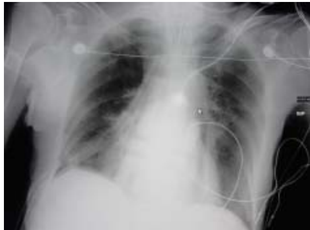
Figure 8. Post-operative chest x-ray revealing complete re-expansion of the right lung after removal of the grape.