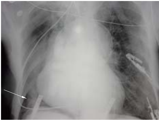
Figure 1. Initial portable chest x-ray. The arrow demonstrates a pleural line consistent with a pneumothorax.