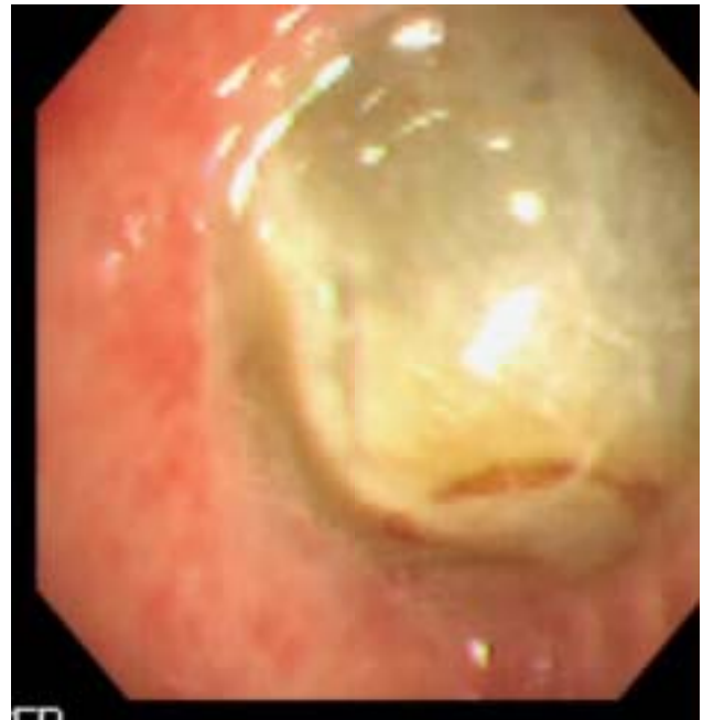
Figure 4. An intact grape obstructing the lumen of the right main bronchus.