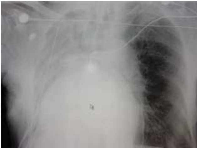
Figure 3. Portable chest x-ray reveals well-placed thoracostomy tube and endotracheal tubes. However, the right lung appears atelectatic and has shifted the mediastinum to the right.