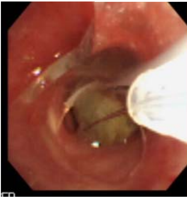
Figure 5. A retrieval snare is placed around the grape.