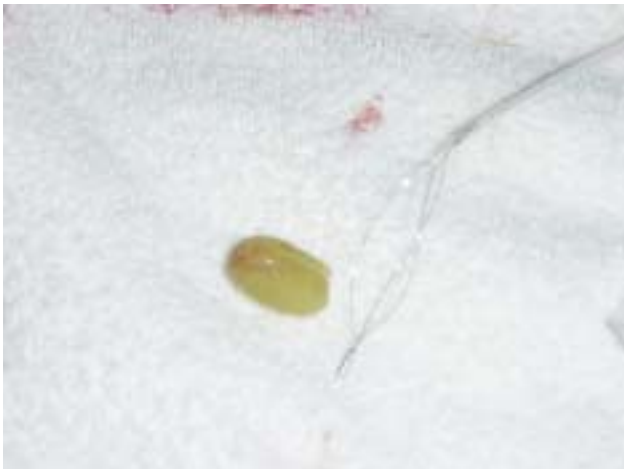
Figure 7. The grape and snare after removal from the patient.