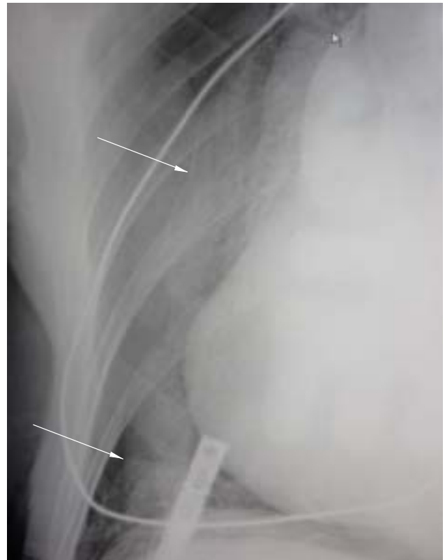
Figure 2. A magnified image of the right side of the patient's chest. The arrows indicate a distinct pleural line.