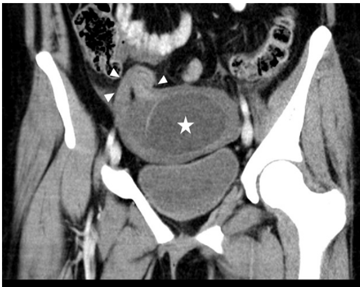
Image 2. Coronal computed tomography of the pelvis shows the 7-centimeter cystic structure (star) within the pelvis with surrounding fluid. Along the right side of the cystic structure there is extension into the location of the area of the right fallopian tube (arrowheads).

Recognition and appropriate management are essential.