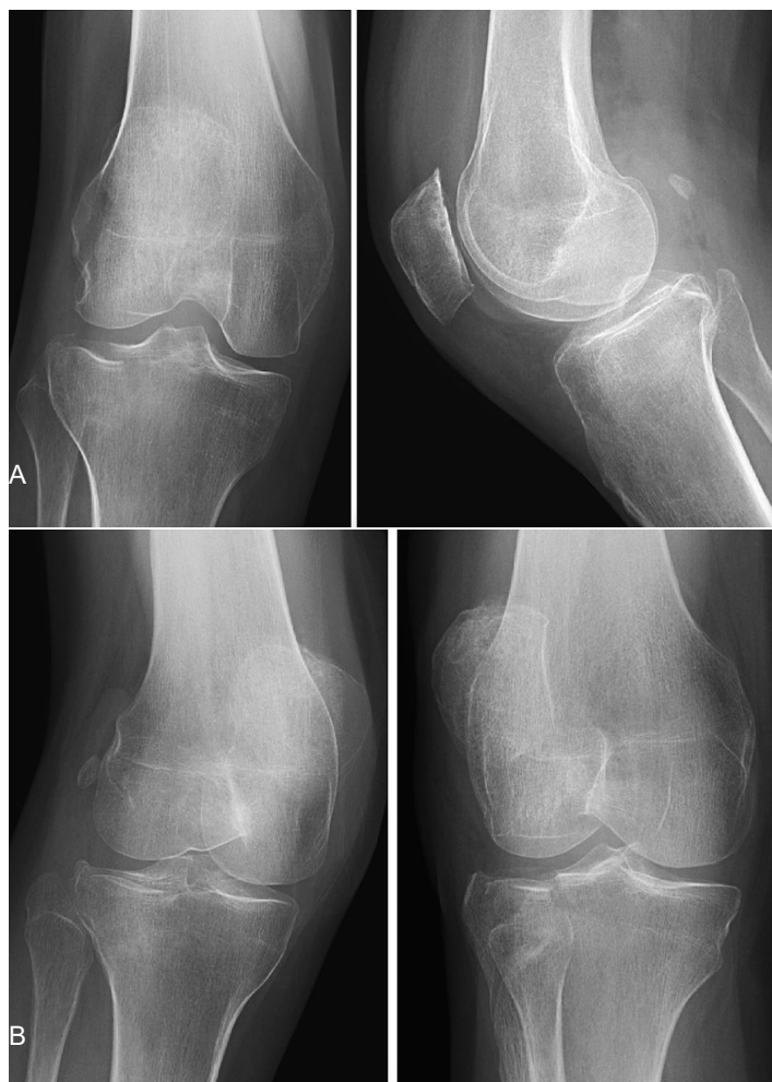
Figure 2. (A) Orthogonal radiographs (two-view) of one “critical miss” that was initially recommended to be best managed with nonoperative treatment but then later was recommended for operative management with the addition of oblique radiographs. Seen to have a lateral tibial plateau fracture. (B) Oblique radiographs (four-view component) of one “critical miss” that was initially recommended to be best managed with nonoperative treatment but then later recommended for operative management with the addition of oblique radiographs. Seen to have a lateral tibial plateau fracture.

from the femur and any tibial plateau abnormalities. 12 While additional radiographic views or tests should be expected to improve detection, the added value of these studies must be assessed against potential costs, clinical or economic, that the studies incur. Furthermore, depending on the suspected injury, there may be more beneficial imaging that targets the suspected location or type of injury, including a caudal tilt plateau view for tibial plateau fractures or an escalation to cross-sectional imaging. 13-15