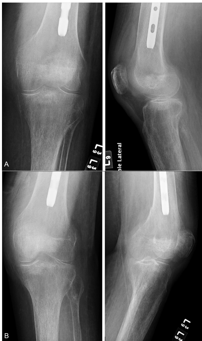
Figure 1. (A) Orthogonal radiographs (two-view) of one “critical miss” that was initially unidentified on orthogonal radiographs and then later identified as requiring operative management with the supplement of oblique radiographs. Seen to have a distal femoral metaphysis fracture. (B) Oblique radiographs (four-view component) of one “critical miss” that was not identified on orthogonal radiographs and then later identified as requiring operative management with the supplement of oblique radiographs. Seen to have a distal femoral metaphysis fracture.

from the femur and any tibial plateau abnormalities. 12 While additional radiographic views or tests should be expected to improve detection, the added value of these studies must be assessed against potential costs, clinical or economic, that the studies incur. Furthermore, depending on the suspected injury, there may be more beneficial imaging that targets the suspected location or type of injury, including a caudal tilt plateau view for tibial plateau fractures or an escalation to cross-sectional imaging. 13-15