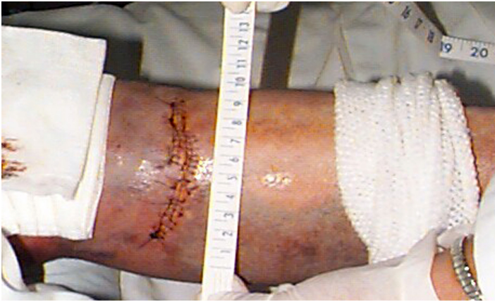
Figure 3. Left lower extremity laceration due to contact with car alarm LED