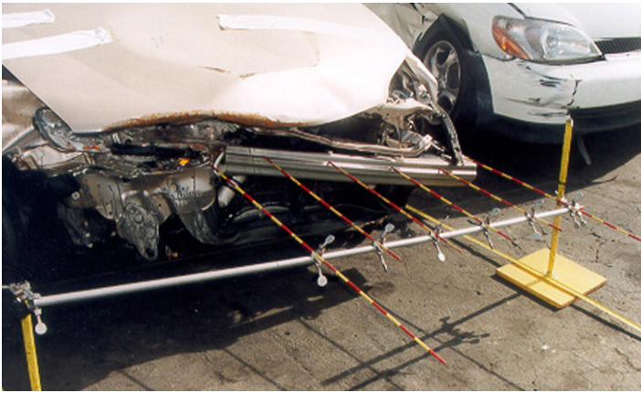
Figure 1. Frontal damage with measurement of vehicle deformation