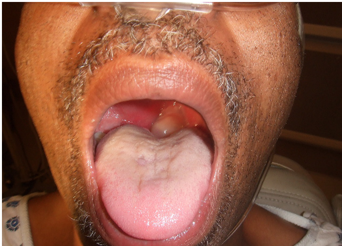
Figure 1. Oropharynx of patient showing hydropic uvula deviated leftward by right peritonsillar abscess.

without incident, and the patient was admitted to the intensive care unit to monitor his respiratory status. The patient was continued on clindamycin and steroids in the hospital. Symptoms completely resolved on day three and he was discharged.