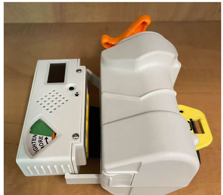
Figure 1. The LAVA TQ*: a user-intuitive tourniquet with a seatbelt design and audiovisual instructions.

applications, in both the control (CAT) and experimental (LAVA TQ) study arms, would occlude blood flow. We then calculated a minimum sample size of 13 applications with each device (26 total) to have 80% power to detect a 10%