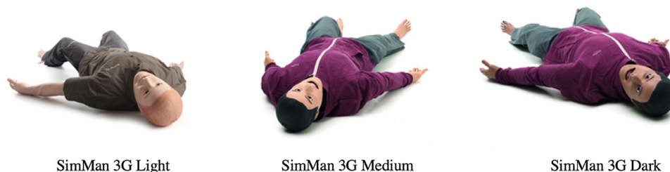
Figure 2. Laerdal SimMan 3G in light, medium, and dark skin tones.

Our study found that while most EM residency programs used high-fidelity simulation manikins to teach cultural humility, the manikins used did not reflect either the skin color or gender proportions of the US population. Further studies will explore the various uses of HFS to teach cultural