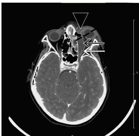
Figure 1. Axial view of contrast-enhanced CT scan demonstrating (black arrow) extraconal orbital subperiosteal abscess with air-fluid collection along the medial and anterior walls of the maxillary sinus with (white arrow) associated lateral displacement of the left medial and inferior recti, (arrowhead) left preseptal cellulitis with proptosis, (dotted line) left maxillary and ethmoid sinusitis.

[West J Emerg Med. 2010; 11(4):398-399.]