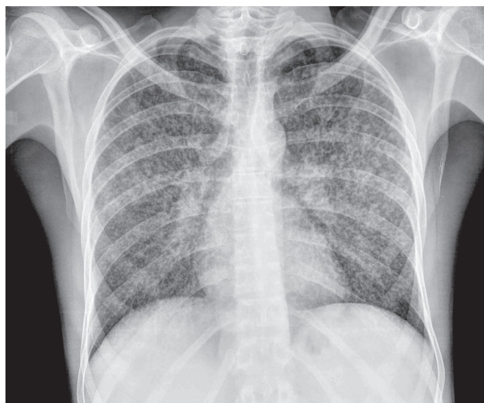
Figure 1. Bilateral micronodular interstitial pattern indicative of miliary tuberculosis.

A tentative diagnosis of septic shock secondary to an infectious respiratory focus was established because of a lack of improvement after treatment with fluids. The patient received empirical antibiotic treatment with levofloxacin 500mg two times a day and trimethoprim sulfamethoxazole 160/800mg three times a day. A human immunodeficiency virus (HIV) test and Ziehl-Neelsen staining of the sputum smear were requested. The Ziehl-Neelsen test was positive