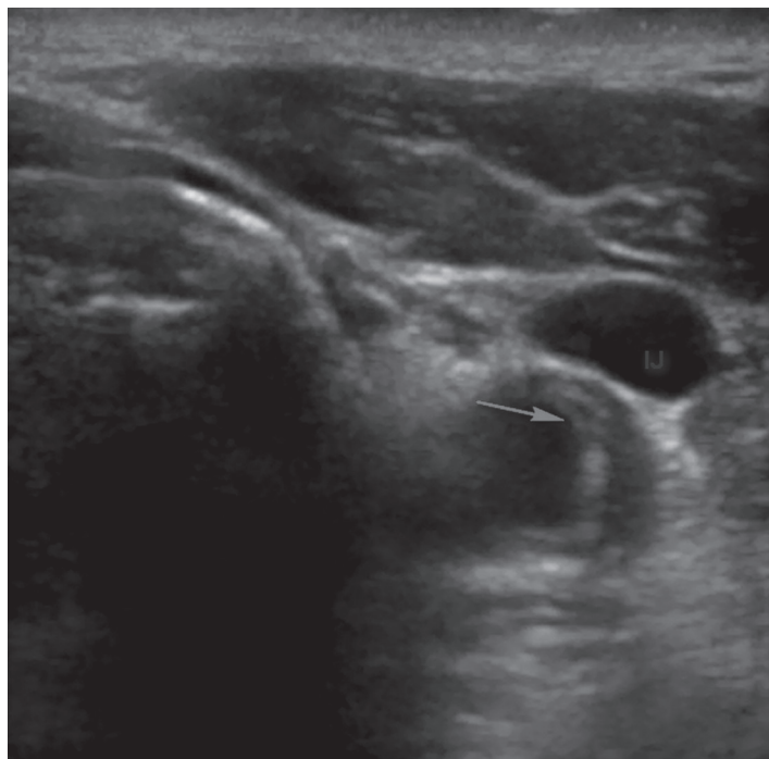
Figure 1. Ultrasound of the common carotid artery showing an intimal flap (IJ) [arrow].

Ultrasound images of a patient presenting to the emergency department with expressive aphasia who was found to have carotid dissection. The first image is a standard two dimensional image that depicts the internal carotid with a visible flap within the lumen. The second image is a color Doppler image showing turbulent flow within the true lumen and visible flow within the false lumen. The case and the patient's outcome are summarized along with some teaching points about carotid dissection. Also, there is some background and research on using ultrasound to help identify dissection. [West J Emerg Med. 2010;11(5):530-531.]