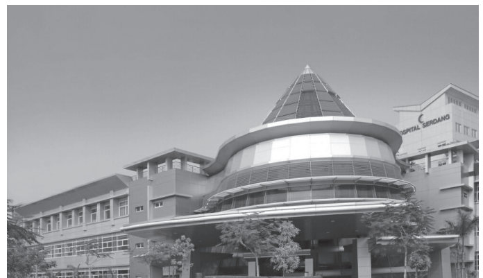
Figure. Hospital Serdang, located in Selangor, Malaysia is approximately 15 miles from the Malaysian capitol of Kuala Lumpur.

Our team had to respond within 12 hours by order of our National security council. We had several roadblocks and issues. First the disaster occurred over the holidays and many staff was on leave. The majority of medical personnel did not have a valid passport. We had to coordinate mobilizing medical personnel from various hospitals urgently. We had inadequate stockpile of equipment and medications and had to pool our resources from several hospitals and clinics to meet the sudden demand. Deployment briefing had to be done at the airport and on the plane. However, post deployment post mortem was done which included psychological assessment.