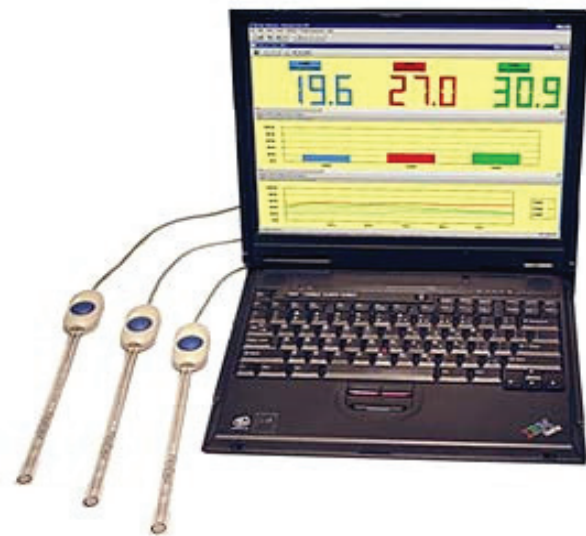
Figure 2. The FlexiForce B201 pressure sensor and Economical Load and Force (ELF) software.

We determined the pressure applied to the representative digit by each of the various tourniquet methods to evaluate for safety. We measured the pressure of the various tourniquet methods using the FlexiForce B201 pressure sensor, a flexible, wafer thin (0.005") 10mm diameter disk-shaped sensor designed specifically to measure the force between two surfaces without disturbing the dynamics of the test (Figure 2). The sensor was placed in a standardized location on the dorsum of each digit equidistant from the metacarpophalangeal joint and proximal phalangeal joint. We calibrated the pressure sensor to measure pressures in the range of 0 to 1000 millimeters of mercury gathered