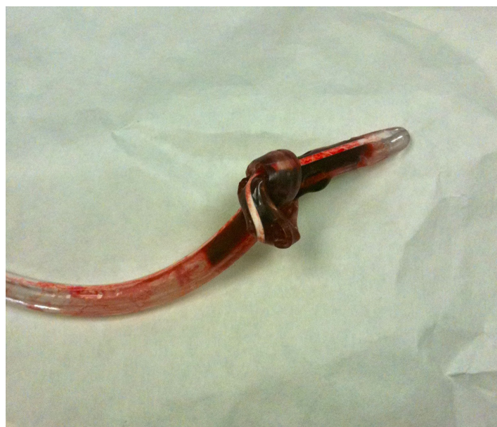
Figure 2. Photograph taken of the knotted tube immediately after removal.