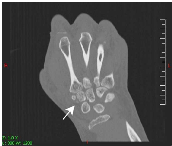
Figure 1. Coronal view computed tomography of wrist demonstrating trapezoid fracture.

second metacarpal. Its position and integrity contribute vitally to the carpal arch, but make detection of injury elusive. 1,2 Fractures are rarely isolated, often involving fractures of the second metacarpal base. 2 Patients may have second metacarpal base tenderness, “snuffbox” tenderness, 3 or pain with axial loading of the second digit 4 after trauma involving an axial or bending force along the second metacarpal. The overlapping bones and intimate articulations of the wrist make plain radiographs difficult to interpret. 1,5 In 2 separate reports reviewing 17 trapezoid fractures, only 1 fracture was diagnosed by plain radiographs; all others required advanced imaging. 6,7 In 1 study, 30% of wrist fractures missed by plain radiograph were diagnosed by computed tomography. 5 Treatment approaches have varied from cast immobilization to open reduction and internal fixation, depending on degree of displacement and integrity of the carpal arch. 1,6 Unrecognized