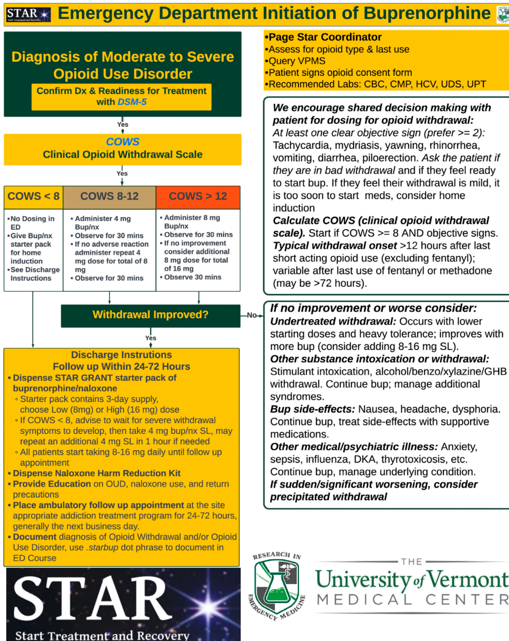
Figure 3. Emergency department initiation of buprenorphine STAR (start treatment and recovery) pathway.

We enhanced our ED’s existing buprenorphine-based MOUD program by incorporating a treatment pathway