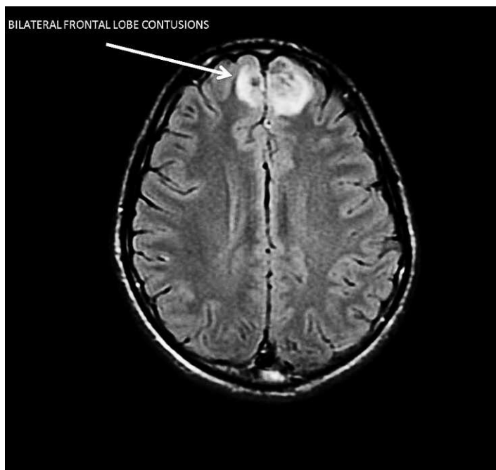
Figure 2. Magnetic resonance imaging of the brain showing frontal lobe contusions.