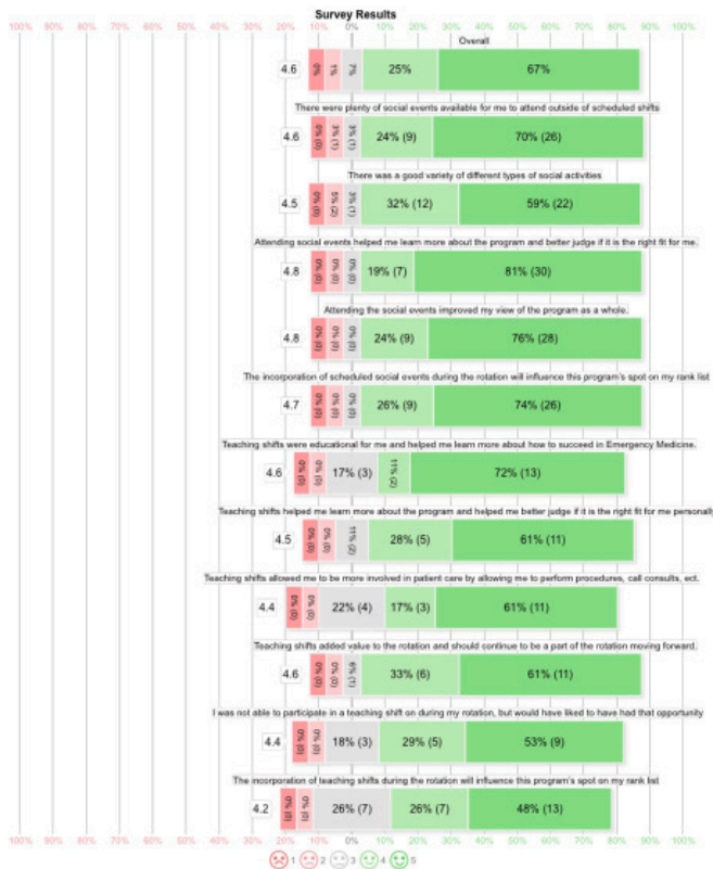
1 = Strongly Agree 2 = Agree 3 = Neutral 4 = Disagree 5 = Strongly Disagree

Conclusions: Virtual interviews changed the landscape of residency interviews. In-state and in-region matches may be more likely for applicants with a virtual interview as both programs and applicants are more familiar with programs in geographic proximity to each other. Virtual interviews allow applicants to save costs associated with travel to in-person interviews and may allow them to complete additional interviews. It is unknown what effect virtual interviews may have on recruiting a diverse emergency medicine residency and this remains an area of significant need for study.