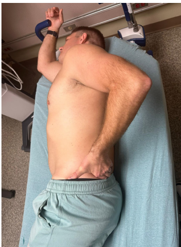
Figure 1. Volunteer in modified Crass position for the supra-short ultrasound protocol.

Lastly, the ultrasound probe should be rotated toward the ear. This will provide a transverse view of the supraspinatus tendon (Figure 3). Although other pathology may be identified, the primary objective of the supra-short protocol is to identify a tear of the supraspinatus tendon, characterized by a visible discontinuity.