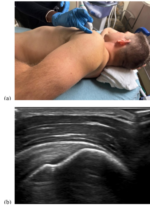
Figure 2. (a) Positioning of the ultrasound probe to obtain the long-axis view of the supraspinatus tendon using the supra-short protocol; and (b) sonographic long-axis view of a normal supraspinatus tendon.