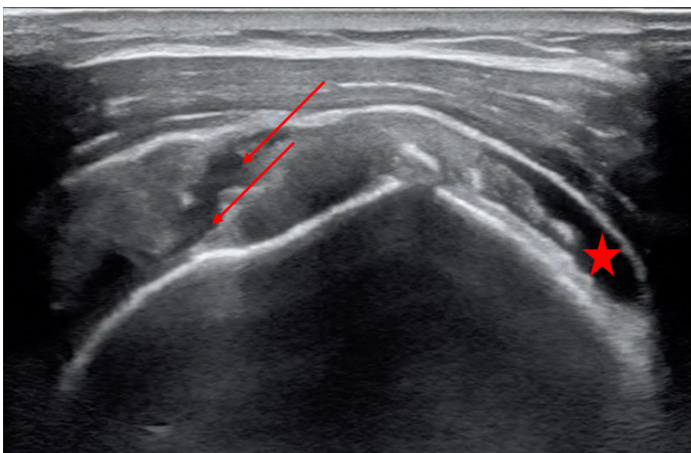
Figure 4. Long-axis view of the right supraspinatus tendon demonstrating an acute full thickness tear indicated by the red arrows with associated fluid collection. Also visible is a fluid collection superiorly (red star).

The second volunteer "patient" who had shoulder pain was found to have pathology consistent with calcific tendinosis on complete ultrasound by the sports medicine physician. Four sonographers scanned this patient (for a total of eight shoulder