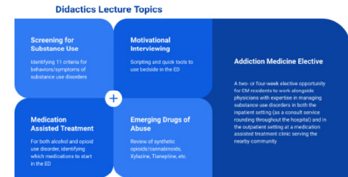
Image 2. Overview of addiction medicine curriculum.