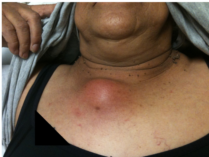
Figure 1. Photograph of patient's wound when she presented to the emergency department.

Septic arthritis of the SC joint accounts for only 1% of all septic arthritis in the general population, but up to 17% in intravenous (IV) drug users. Common risk factors include IV drug use, distant site of infection, diabetes mellitus, and thoracic central venous line (CVL) placement. Less common predisposing conditions include minor trauma, cellulitis, cirrhosis, and immunocompromised states. Unlike the acute presentation of other septic joints, SC septic arthritis usually develops more slowly over 14 days. 1,2