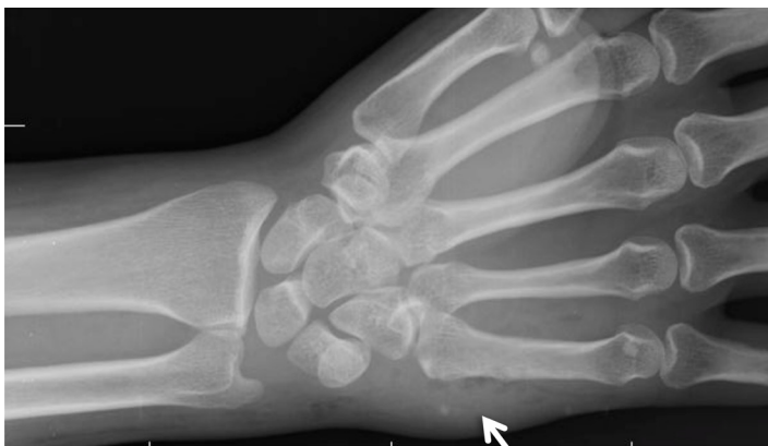
Figure 3. Right upper extremity of Patient 2. Wrist radiograph demonstrates subcutaneous emphysema (arrow) extending from injection site and hand down to forearm.

He developed cellulitis of the right upper extremity near the injection site in the right antecubital fossa on the second hospital day and was started on 1 gm of vancomycin and 3.375 gm piperacillin/tazobactam. Repeat laboratory studies on hospital day 2 demonstrated increasing leukocytosis with WBC 16.4 k/mm 3 with 5% band neutrophils and 76% segmented neutrophils. The cellulitis progressed into an abscess and on hospital day 7, the patient was taken to the operating room for incision and drainage. The procedure demonstrated liquefied necrotic subcutaneous tissue, which was debrided and excised, and the wound was packed with iodoform gauze. Culture of the abscess revealed no growth of any organisms. After incision and drainage, the patient improved clinically with reduction in pain and redness in his right upper extremity. CXR findings resolved (Figure 2) by hospital day 3, and he was discharged after 9 days to inpatient psychiatric care.