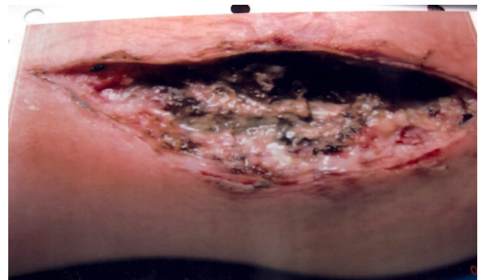
Figure 4. Fasciotomy of forearm shows diffuse fat necrosis of Patient 2.