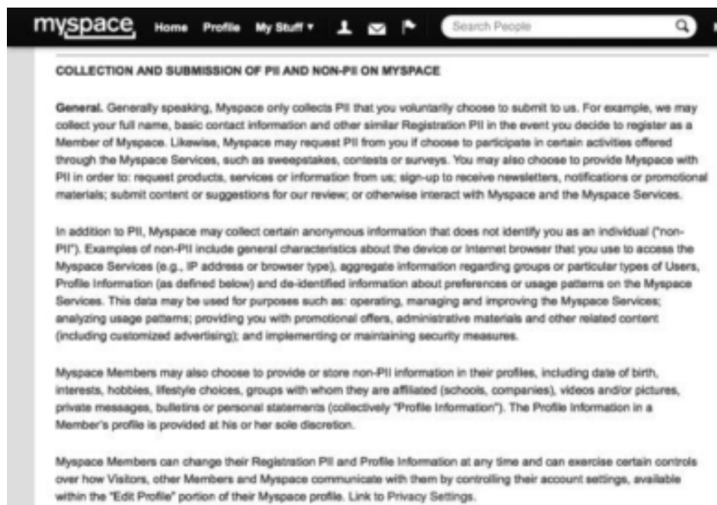
Figure 1. MySpace privacy policy.

An important function blogging provides for users is an outlet to share emotions with a community and receive feedback. 3 Prior to the advent of blogs, journals were used as a coping strategy, and multiple studies have shown that this remains an effective therapeutic tool, leading to a revitalization of the author’s physical, emotional, and psychological health, and improving social functioning. 13-17 In 2006 a study found that 70% of blogs were considered