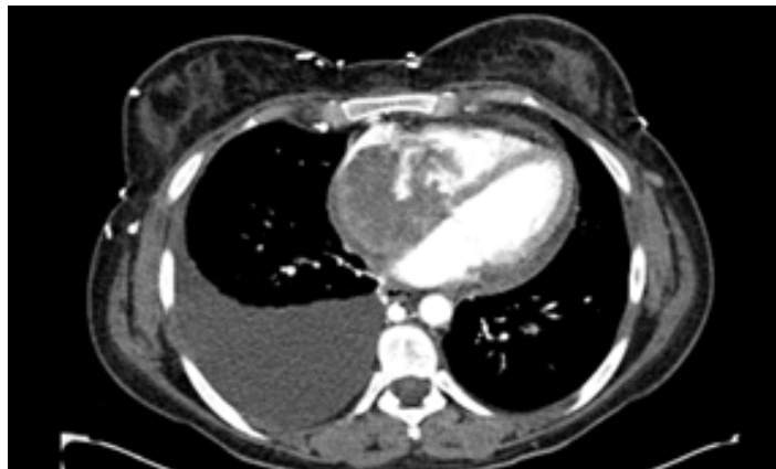
Figure 2. Axial computed tomography angiogram of the chest showing intracardiac contrast-filling defect with an associated right-sided pleural effusion.