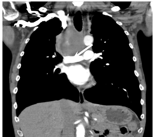
Figure 2. Coronal computed tomography of paratracheal mass with right anterolateral tracheal involvement.

A 52-year-old male presented to the emergency department with chest pain, shortness of breath and hemoptysis that had been worsening over the past two days. Past medical history included a history of non-small cell lung carcinoma, which he had completed radiation therapy approximately four months prior and was currently undergoing chemotherapy. Significant vitals upon presentation included a respiration rate of thirty-six breaths/min and peripheral oxygen saturation measuring 80%. Physical examination revealed a cachectic male appearing older than his actual age, alert and oriented to person, place and time with rhonchi throughout his lung fields and decreased breath sounds on the right. He was started on non-invasive biphasic positive airway pressure with mild improvement of clinical status. An anteriorposterior chest radiograph was performed and prior computed tomography of the chest was reviewed (Figures 1, 2). Computed tomography of the chest was also repeated on the day of presentation (Figure 3).