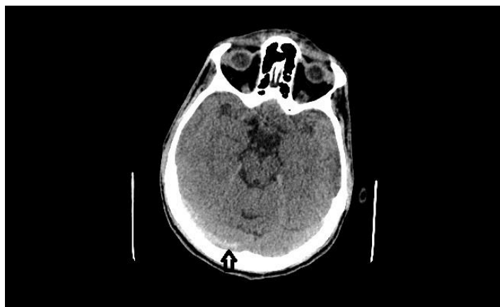
Figure 1. Computed tomography of the brain demonstrating hyperdensity in the region of right transverse sinus (arrow).

Conflicts of Interest: By the WestJEM article submission agreement, all authors are required to disclose all affiliations, funding sources and financial or management relationships that could be perceived as potential sources of bias. The authors disclosed none.