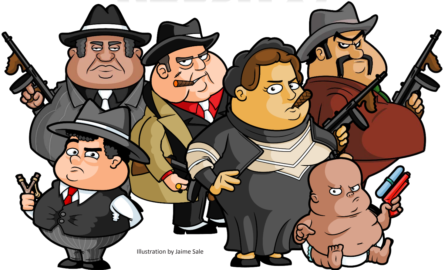
Illustration by Jaime Sale